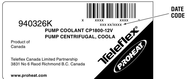
Figure C. Label Date Code Location.